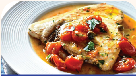
GIRLLED FISH MEAL