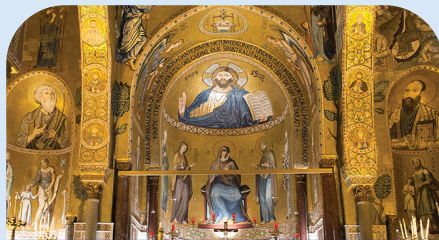
NORMAN PALACE PALERMO