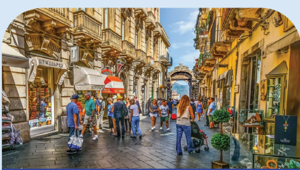
TAORMINA PEDESTRIAN STREET