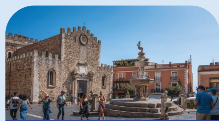
PIAZZA IX APRILE