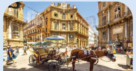
QUATTRO CANTI SQUARE