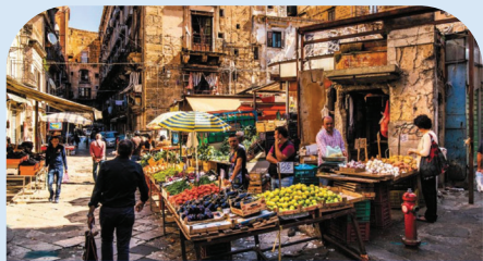
PALERMO BALLARÒ MARKET