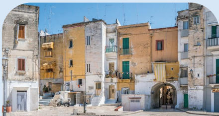
BARI'S OLD TOWN

🏠 HOTEL: Grand Hotel Olimpo Alberobello or SML