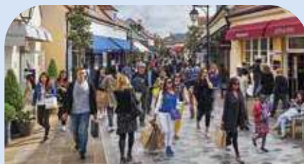
LA VALLE OUTLET