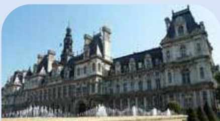
HÔTEL DE VILLE