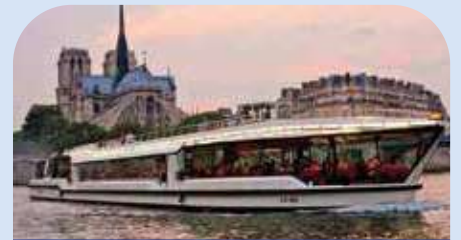
SEINE RIVER CRUISE