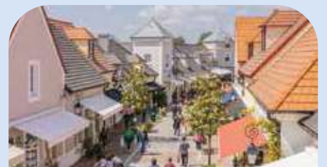
LA VALLE OUTLET