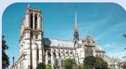
NOTRE-DAME DE PARIS