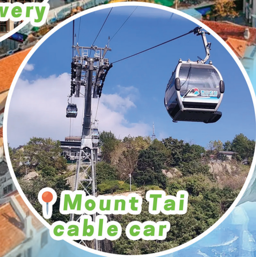
Mount Tai cable car