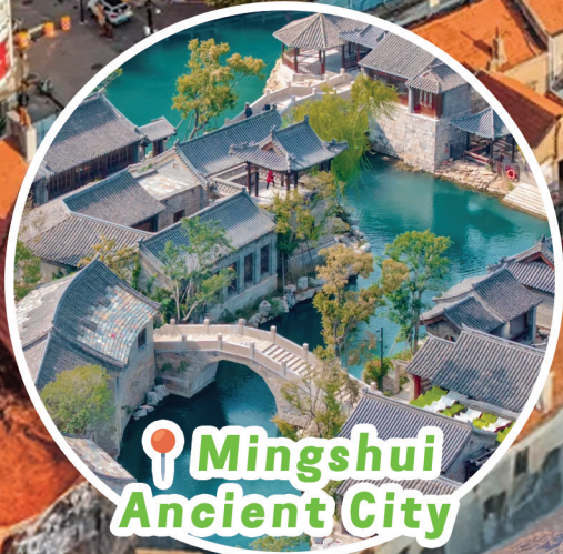
Mingshui Ancient City