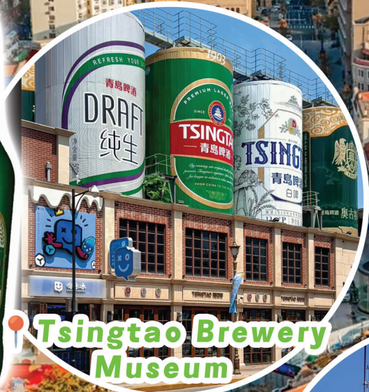
Tsingtao Brewery Museum