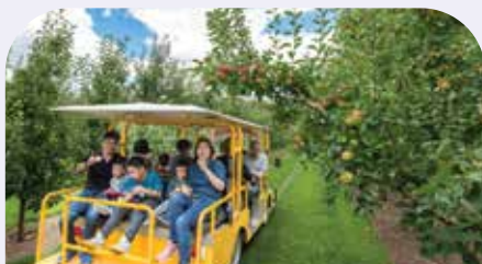
ENJOY SEASONAL FRUIT PICKING (LIMITED-TIME ONLY)