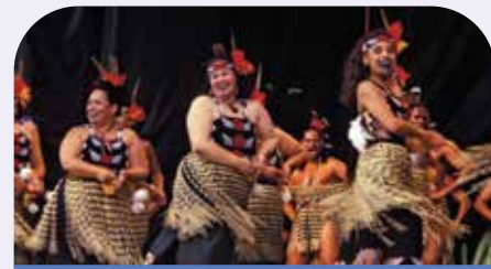
MĀORI CULTURAL PERFORMANCE