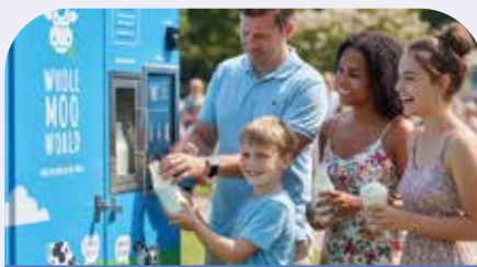
ENJOY FRESH LOCAL MILK