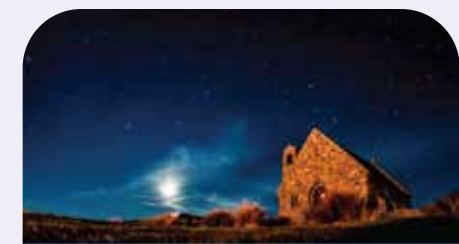
ADMIRE NEW ZEALAND'S DAZZLING STARRY SKY