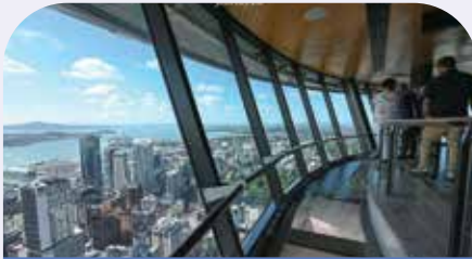
SKY TOWER: PANORAMIC CITY VIEWS