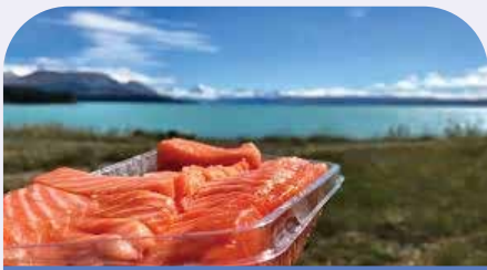
HIGH COUNTRY SALMON