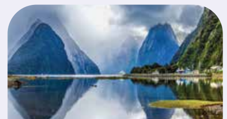
MILFORD SOUND CLIFFS