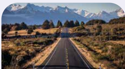
MILFORD SCENIC HIGHWAY