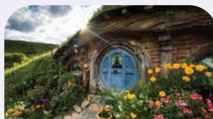
HOBBITON MOVIE SET