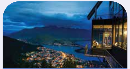
SKYLINE HILLTOP NIGHT VIEW RESTAURANT