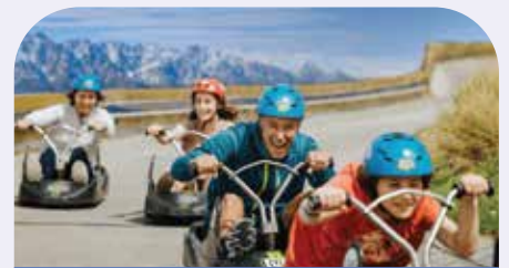
OPTIONAL ACTIVITY: LUGE RIDE (AT OWN EXPENSE)