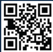
Farm Interaction experience