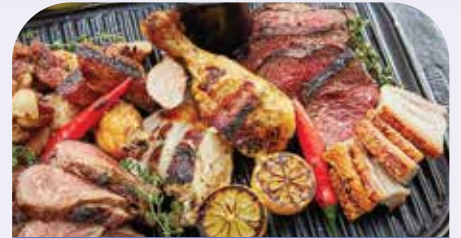
FARM BBQ BUFFET