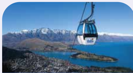
SKYLINE GONDOLA RIDE