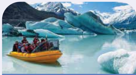
TASMAN GLACIER BOAT CRUISE