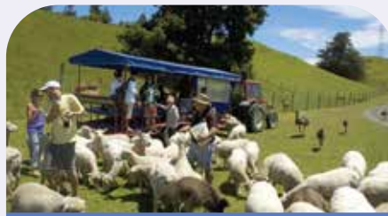
AGRODOME ROYAL FARM