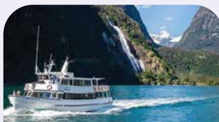
MILFORD SOUND SCENIC CRUISE