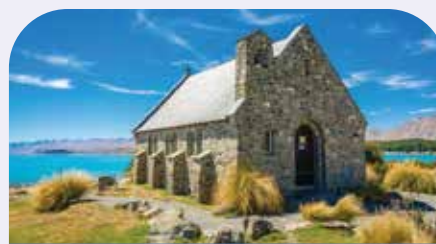
CHURCH OF THE GOOD SHEPHERD