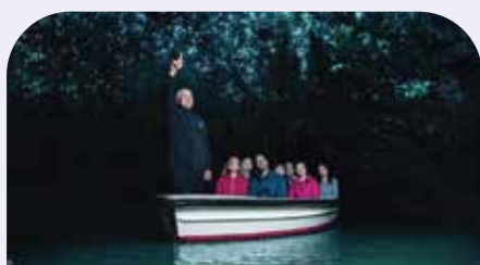
WAITOMO GLOWWORM CAVES