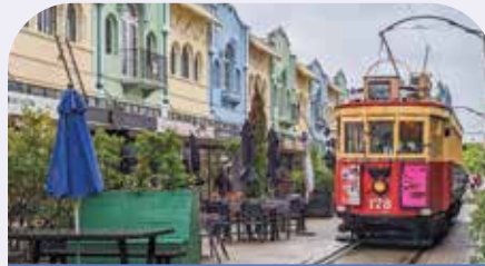
VINTAGE TRAM RIDE