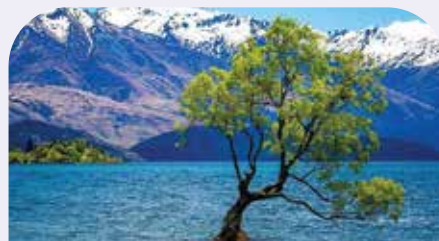
THAT WANAKA TREE