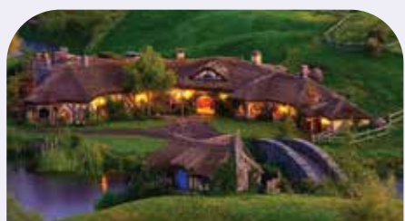
MIDDLE-EARTH FILM SET SCENES