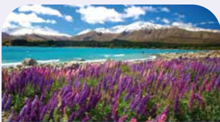
LAKE TEKAPO LAKESIDE