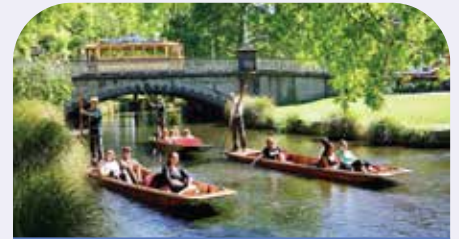
CHRISTCHURCH BOTANIC GARDENS PUNTING