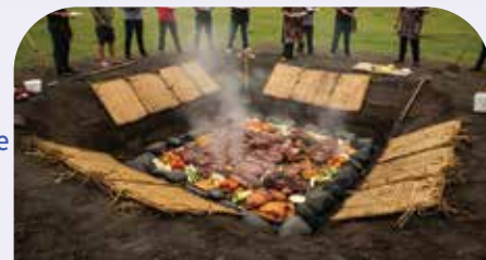
MĀORI HANGI FEAST