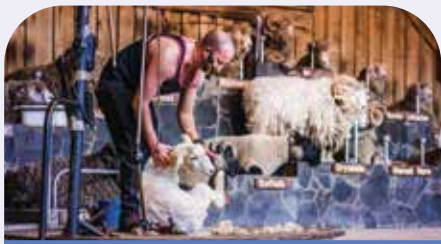
CLASSIC SHEEP SHEARING SHOW