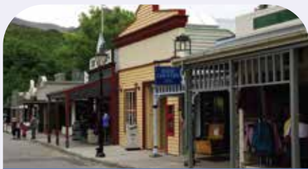
ARROWTOWN – CHARMING STREETS