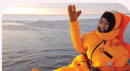
Ice floating experience