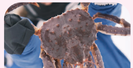
King Crab Safari