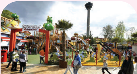
Angry Birds Park