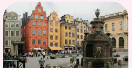
Stockholm Main Square

✓ Breakfast : MOB ✓ Lunch : MOB ✓ DINNER