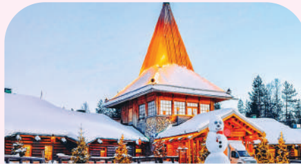
Santa Claus Village