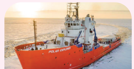
Arctic icebreaker adventure cruise