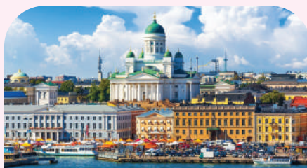
City view of Helsinki