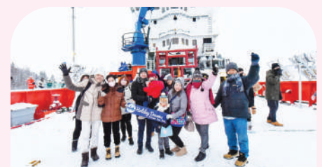
Arctic icebreaker adventure cruise