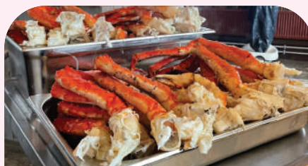
King Crab Lunch