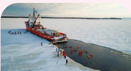
Arctic icebreaker adventure cruise