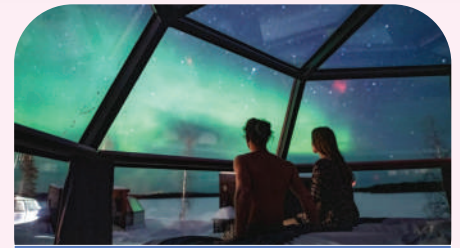
Aurora viewing from glass house