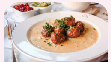
Sweden Meatballs 瑞典肉丸