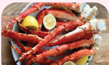
King Crab Leg 帝王蟹腿