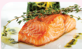
Norwegian Salmon 挪威三文鱼