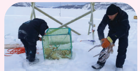
King Crab Safari