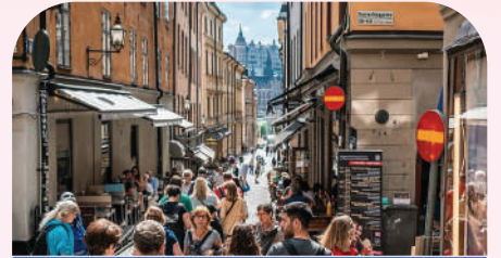
Stockholm Old town