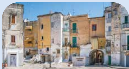
BARI' S OLD TOWN

🏠 HOTEL: Grand Hotel Olimpo Alberobello or SML