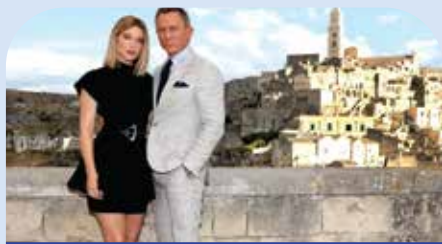
MATERA, A FILMING LOCATION FOR "JAMES BOND 007"