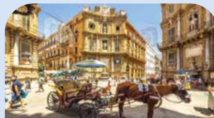
QUATTRO CANTI SQUARE