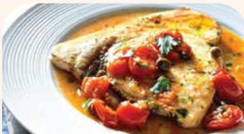
GIRLLED FISH MEAL