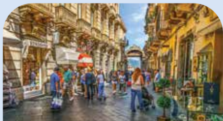
TAORMINA PEDESTRIAN STREET