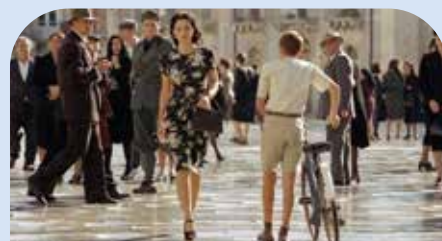
SIRACUSA "MALENA" MOVIE