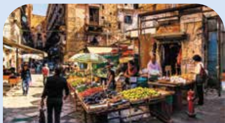
PALERMO BALLARÒ MARKET