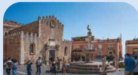
PIAZZA IX APRILE