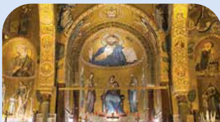
NORMAN PALACE PALERMO