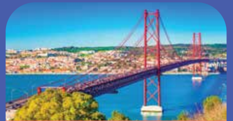
25TH APRIL BRIDGE