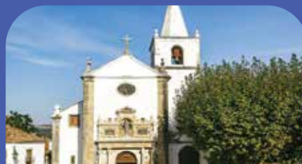
CHURCH OF SANTA MARIA