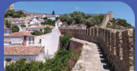
WALLS OF OBIDOS