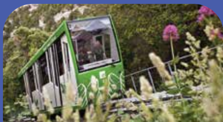
SANT JOAN FUNICULAR