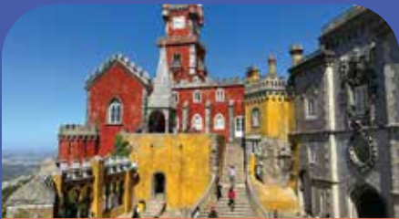
PENA NATIONAL PALACE