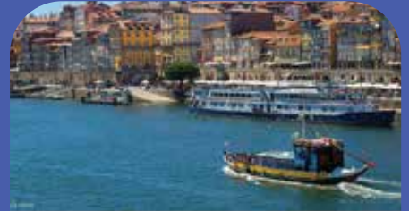
DUORO RIVER BOAT TOUR