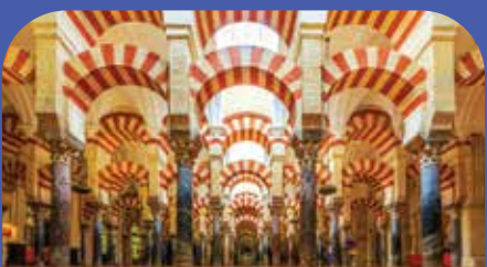
MOSQUE OF CORDOBA