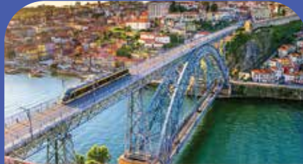
DOM LUÍS I BRIDGE