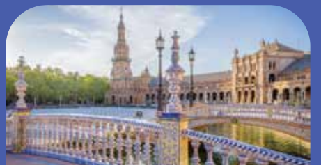
PLAZA DE ESPAÑA