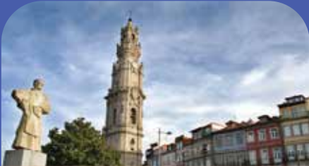
TOWER OF THE CLERICS