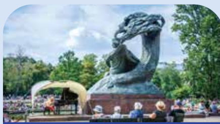
CHOPIN PARK (ŁAZIENKI PARK)