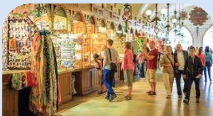
CLOTH HALL (SUKIENNICE)