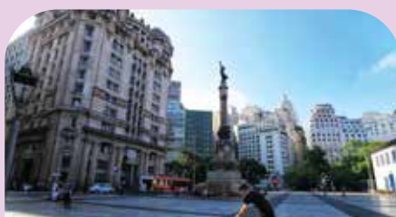
WALL STREET OF BRAZIL