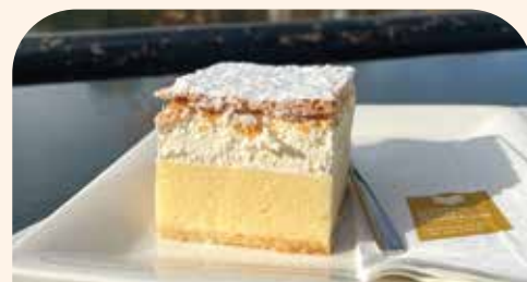
BLLED CREAM CAKE

The image is for reference only. Please refer to the actual product.