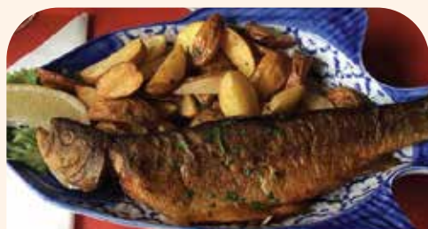
GRILLED FISH MEAL