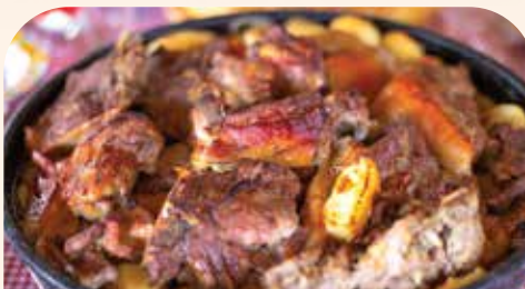
BEKA'S SLOW-ROASTED MEAT