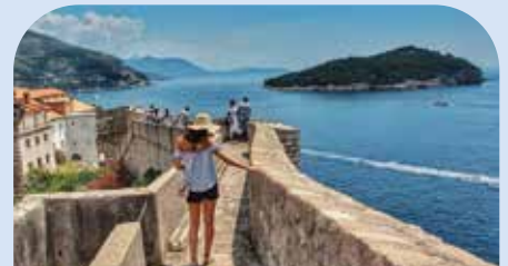
OLD CITY WALLS OF DUBROVNIK