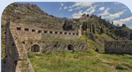
WALL OF KOTOR