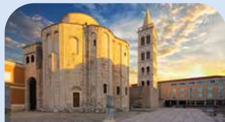
CHURCH OF DOANTUS