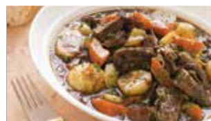
Spanish-style oxtail stew