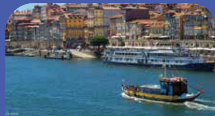
DUORO RIVER BOAT TOUR