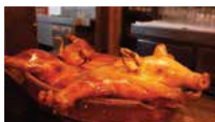
Segovian-style roasted suckling pig