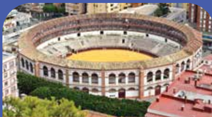
PLAZA DE TOROS