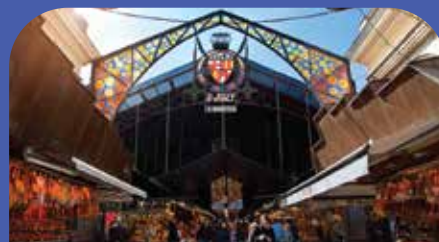
LA BOQUERIA MARKET