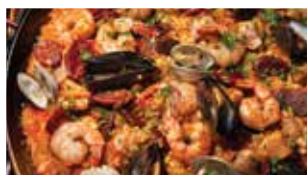
Barcelona-style seafood paella