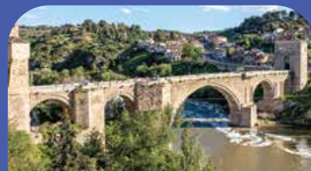
SAN MARTIN BRIDGE