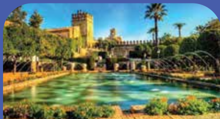
THE ALCAZAR DE LOS REYES CRISTIANOS