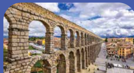
ROMAN AQUEDUCT OF SEGOVIA