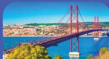
25TH APRIL BRIDGE