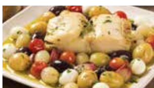
Portuguese-style codfish meal