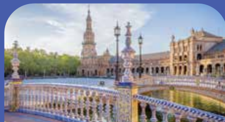
PLAZA DE ESPAÑA