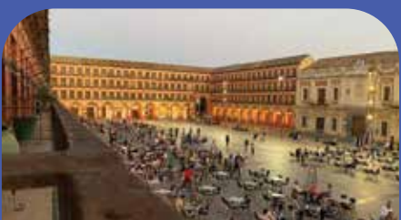
PLAZA DE LA CORREDERA