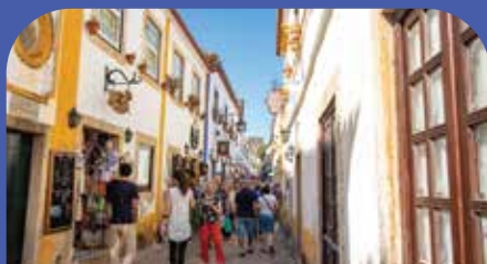
ÓBIDOS OLD TOWN