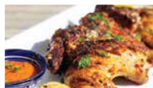
Portuguese-style grilled chicken meal