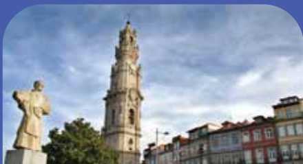
TOWER OF THE CLERICS