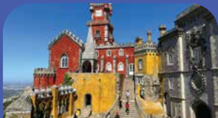
PENA NATIONAL PALACE