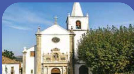
CHURCH OF SANTA MARIA