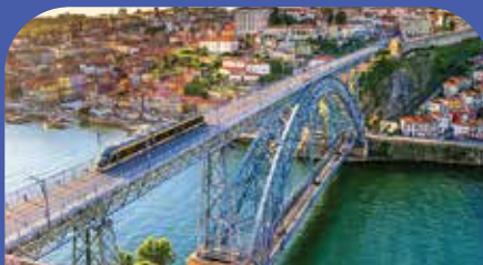
DOM LUÍS I BRIDGE