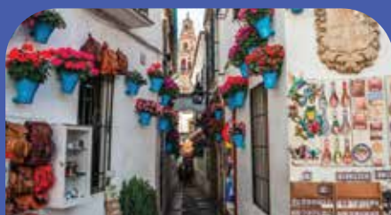
CALLEJA DE LAS FLORES