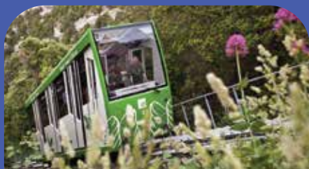
SANT JOAN FUNICULAR