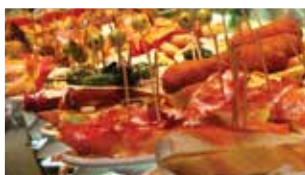
Madrid-style tapas for appetizers