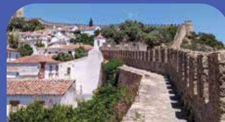
WALLS OF OBIDOS