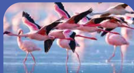
LAKE BOGORIA - FLAMINGOS