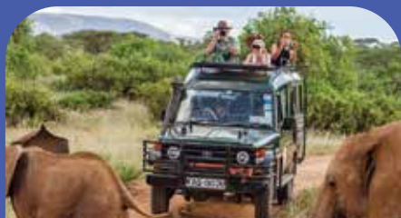
OFF-ROAD SAFARI TOUR

BREAKFAST - HOTEL / LUNCH - HOTEL / DINNER - HOTEL