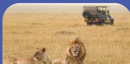
MAASAI MARA NATIONAL RESERVE VIEW LIONS FROM A DISTANCE