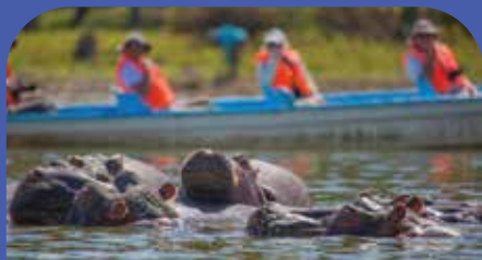
LAKE NAIVASHA - HIPPOS

BREAKFAST - HOTEL / LUNCH - HOTEL / DINNER - HOTEL