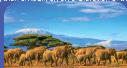
MAASAI MARA NATIONAL RESERVE

BREAKFAST - HOTEL / LUNCH - HOTEL / DINNER - HOTEL