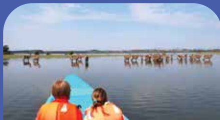
ENJOY A BOAT RIDE ON THE LAKE