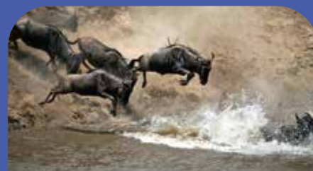
MARA RIVER CROSSING