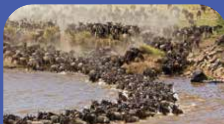
MARA RIVER CROSSING