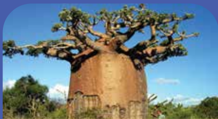
THE GIANT BAOBAB TREE

BREAKFAST - HOTEL / LUNCH - OWN ARRANGEMENT / DINNER - HOTEL