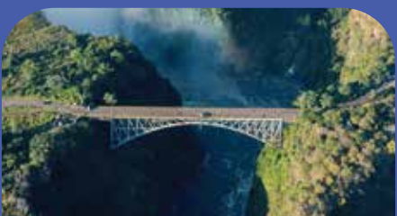
VICTORIA FALLS BRIDGE

BREAKFAST - HOTEL / LUNCH - RESTAURANT / DINNER - BOMA BUFFET BBQ DINNER & PERFORMANCE