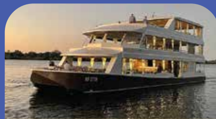
ZAMBEZI RIVER BOAT CRUISE