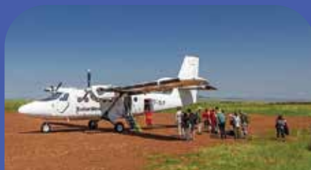
SMALL PLANE TO NAIROBI