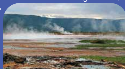
LAKE BOGORIA - HOT SPRINGS

BREAKFAST - HOTEL / LUNCH - HOTEL / DINNER - HOTEL