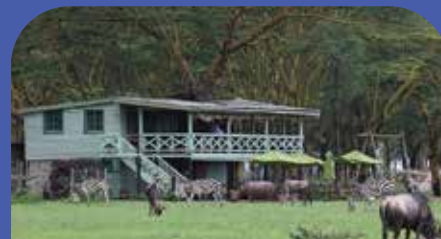
PRIVATE FARMS ALONG THE SHORES