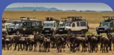
MAASAI MARA NATIONAL RESERVE