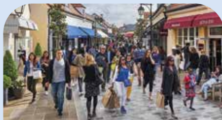
LA VALLE OUTLET