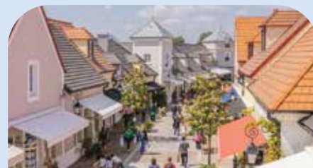
LA VALLE OUTLET