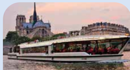
SEINE RIVER CRUISE