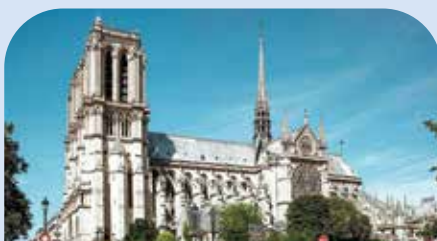
NOTRE-DAME DE PARIS