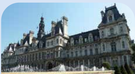
HÔTEL DE VILLE