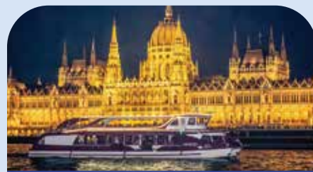
DANUBE RIVER TOUR