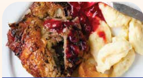
ROAST DUCK WITH APPLES