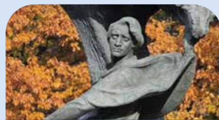
THE STATUE OF CHOPIN