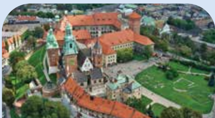
WAWEL ROYAL CASTLE