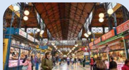
CENTRAL MARKET HALL