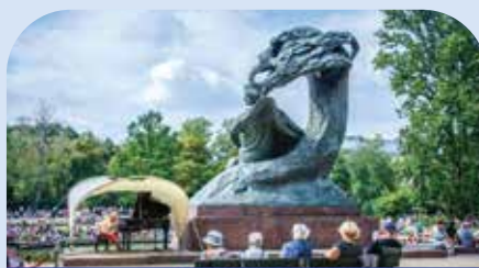
CHOPIN PARK (ŁAZIENKI PARK)