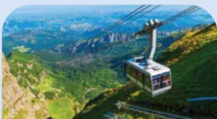
TATRA MOUNTAINS (CABLE CAR)