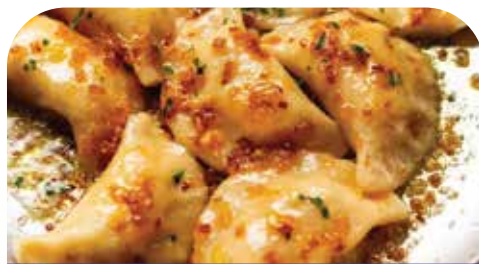
POLISH DUMPLINGS (PIEROGI)