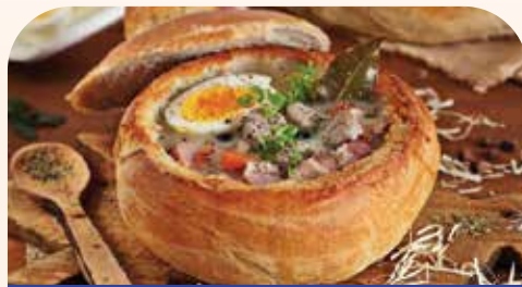
JÓKAI BABLEVES OR KOVÁSZOS KENYÉRLEVES

The image is for reference only, and the actual product may vary