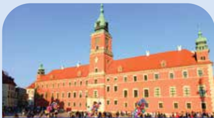
ROYAL CASTLE IN WARSAW