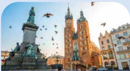
CASTLE SQUARE (WARSAW)