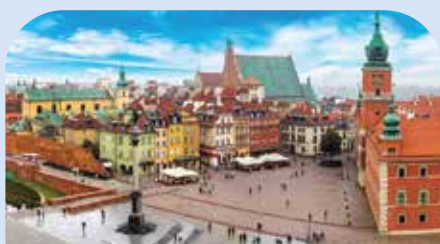
THE CAPITAL OF POLAND, WARSAW