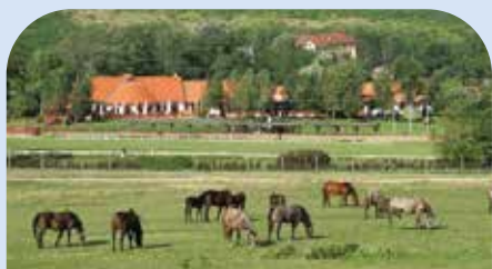
LÁZÁR HORSE RANCH