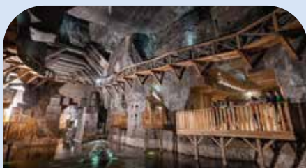
WIELICZKA SALT MINE