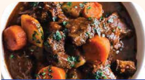
HUNGARIAN SOUP ( *LEVES*)