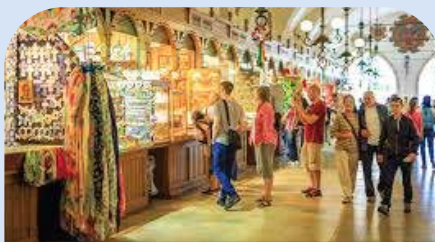
CLOTH HALL (SUKIENNICE)