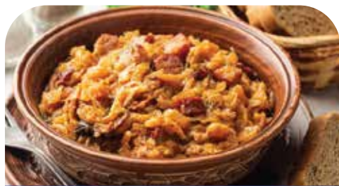
HUNTER'S STEW ( *PÖRKÖLT*)

Specially arranged local delicacies in the itinerary.