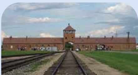
AUSCHWITZ CONCENTRATION CAMP