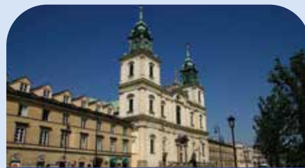
HOLY CROSS CHURCH