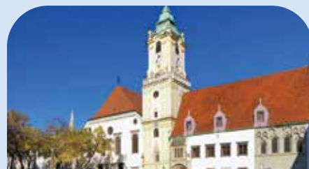
OLD TOWN HALL (BRATISLAVA)