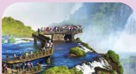
IGUAZU NATIONAL PARK