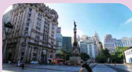
WALL STREET OF BRAZIL