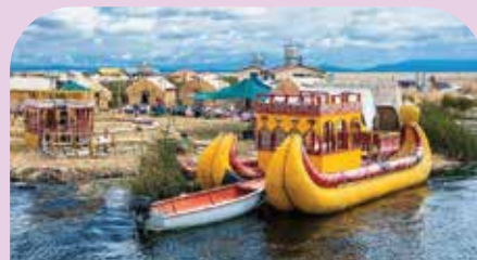
UROS FLOATING ISLANDS

INCLUDED HOTEL BREAKFAST , LUNCH, DINNER