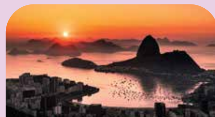
SUGARLOAF MOUNTAIN' SUNSET

INCLUDED HOTEL BREAKFAST , LUNCH, DINNER