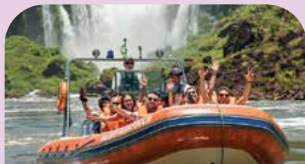
( OWN EXPENSE) BOAT RIDE