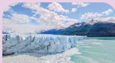
PERITO MORENO GLACIER