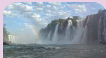
IGUAZU NATIONAL PARK

INCLUDED HOTEL BREAKFAST , LUNCH, DINNER