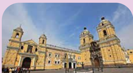
SAN FRANCISCO MONASTERY