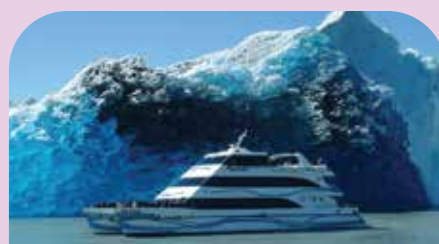
LAGO ARGENTINO BOAT TOUR