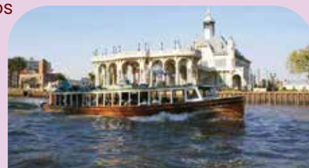
TIGRE DELTA BOAT TOUR