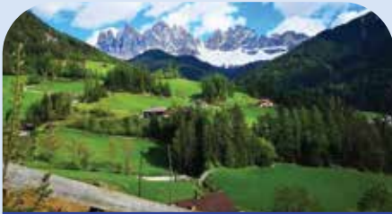
VAL DI FUNES