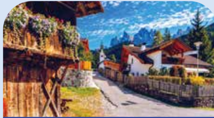
SANTA MAGDALENA VILLAGE