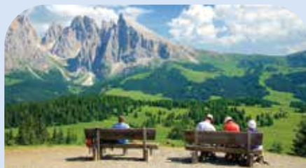
ALPE DI SIUSI