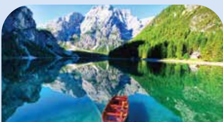
LAGO DI BRAIES