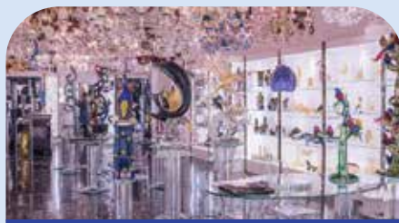
MURANO ISLAND GLASS FACTORY