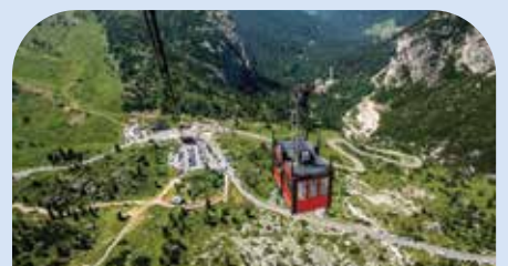
LAGAZUOI CABLE CAR