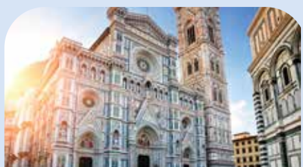
CATHEDRAL OF SANTA MARIA DEL FIORE