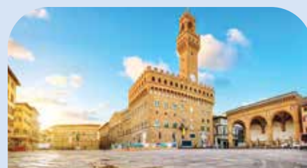
PIAZZA DELLA SIGNORIA