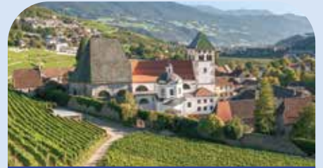
NOVA CELLA WINERY