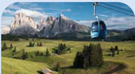
CABLE CAR - ALPE DI SIUSI