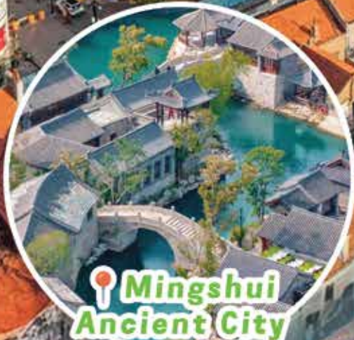
Mingshui Ancient City