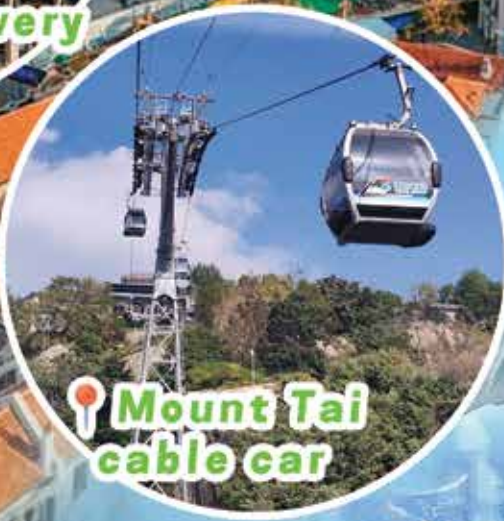
Mount Tai cable car