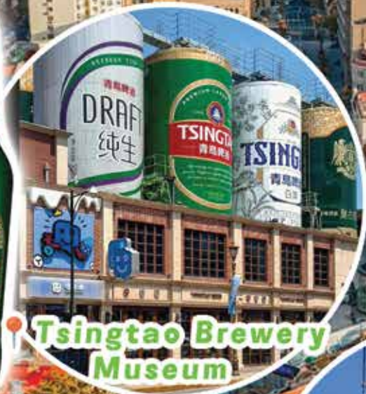
Tsingtao Brewery Museum