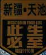
HEAVENLY LAKE OF TIANSHAN