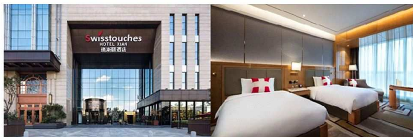
SWISSTOUCHES HOTEL OR SML 西安大天瑞斯丽酒店或同级