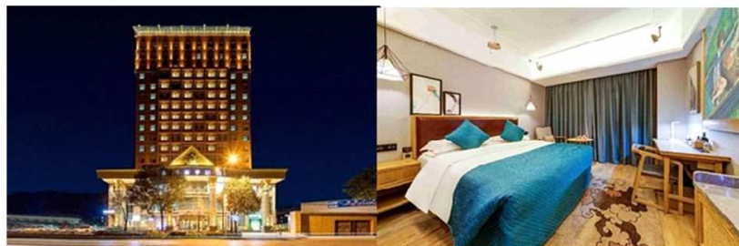
MEHOOD HOTEL OR SML 延安新美豪酒店或同级