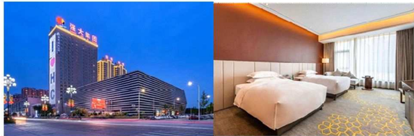
GRAND SKYLIGHT HOTEL OR SML 韩城格兰天酒店或同级