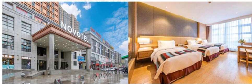
NOVOTEL HUASHAN OR SML 华山诺富特酒店或同级