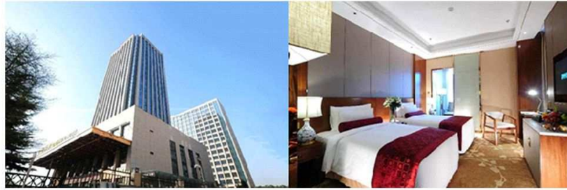
YONGCHANG HOTEL OR SML 榆林永昌国际大酒店或同级