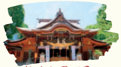
Kushida-Jinja Shrine 栴田神社

栴田神社 - 福冈市最古老的神社，也是城市的总镇守。人们一直相信“栴田上神”会带来长寿与繁荣。