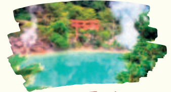
Umi Jigoku 海地狱

天空小火车 - 景色超美小火车，高千穗以壮观的高千穗峡最有名，除了看壮观峡谷，可以感受高千穗的四周山林与市区街景