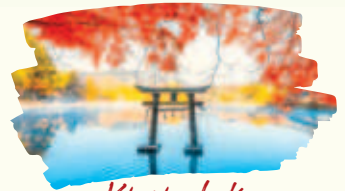
Kinrin Lake 金鱗湖