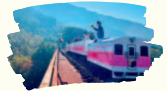
Sky Train 天空小火车

Umi Jigoku - Umi Jigoku was formed 1,200 years ago when Mt. Tsurumi erupted. Because it is made of iron sulfate, the pool water presents a clear blue color, giving people the feeling of looking at the sea, but the temperature is as high as 98°C. You can use the high temperature of Hell to cook eggs. It only takes 6 minutes to cook a basket of fresh eggs. It is a famous product of Hell.