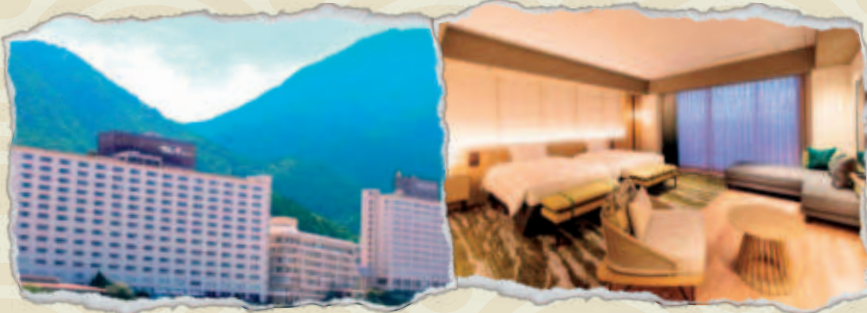
衫乃弗温泉度假村 Orix Hotels & Resort or similar class