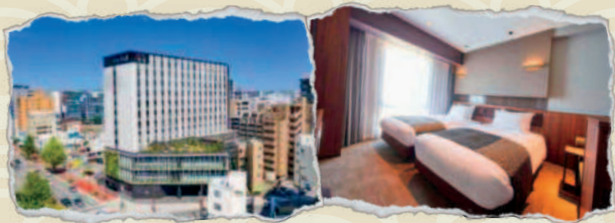
Hotel Trad Hakata or similar class