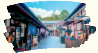
Josai Garden 城彩苑

Josai Garden - A place good for shopping and eating in the antique atmosphere. The Sakura old street since Edo period is a must visit site. Popular snacks include sea urchin croquette and Hojicha ice cream.