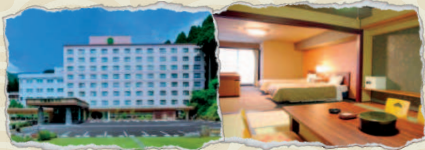
霧島城堡飯店 Hotel Kirishima Castle or similar class