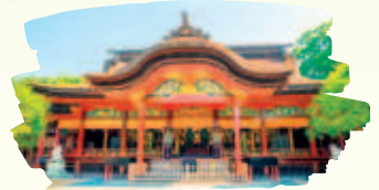
Dazaifu Tenmangu 太宰府天满宫