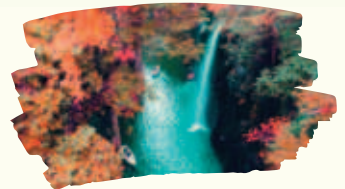
Takachiho Gorge 高千穗红叶峡谷

Takachiho Gorge - A gorge with magnificent columnar cliffs formed by the eruption of Mount Aso. Known as the symbol of the place, "Manai Waterfall", its magnificent landscape is definitely the finale. The limited-time lighting and autumn leaves are also worth seeing. There are also many shrines and attractions related to Japanese mythology scattered around the area.