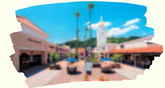
Tosu Premium Outlets 鸟栖奥特莱斯