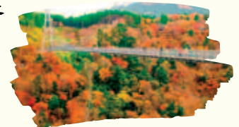
Kokonoe Yume Otsuribashi 九重梦大吊桥

汤布院童话村 - 以英国科茨沃尔德为主要设计的乐园，也就是哈利波特的取景地！这里让你体验各种梦幻的感觉，也可以买到很多《爱丽丝梦游仙境》、《彼得兔》和《吉卜力》等电影相关商品。你可以在这童话村里漫步，这里就好像梦中场景一样呢！