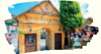
Yufuin Floral Village 汤布院童话村

Yufuin Fairy Taleage lage - a paradise designed based on Cotswolds, England, which is also the filming site of Harry Potter movie. Here you can you can also buy a lot of movie-related products such as "Alice in Wonderland", "Peter Rabbit" and "Ghibli". You can stroll in this fairy tale village, it's like a scene in a dream!