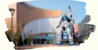
The world's largest Gundam Park 世界最大的钢弹商场