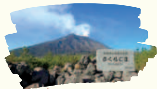
Arimura Lava Observation Deck 有村展望台

仙岩园 - 这个庭院是岛津家第19代家主岛津光久于1658年建造的岛津家的别邸。2015年，荣登联合国教育科学组织世界文化遗产名录。庭院用借景的手法将雄伟的樱花岛作园子里的山将锦江湾作园子里的水，美不胜收，被誉为天下名园。