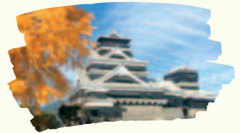
Kumamoto Castle 熊本城

Kumamoto Castle - A hilltop Japanese castle in Chuo-ku, Kumamoto City, Kumamoto Prefecture, Kyushu. It occupies a vast area and is extremely well-defended. The castle's tall tower (tenshukaku) is a concrete reconstruction built in 1960 but several of the original castle's outbuildings of wood remain intact.