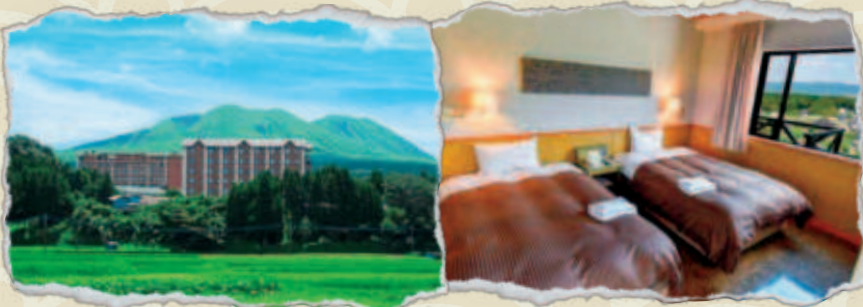
阿苏公园温泉 Spa 酒店 Aso No Tsukasa Villa Park Hotel & Spa or similar class