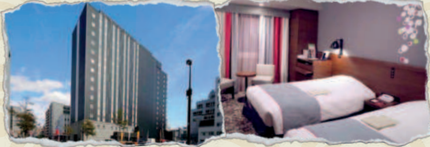
福岡蒙特埃马纳酒店 Hotel Monte Hermosa Fukuoka or similar class