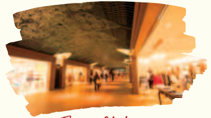
Tenjin Chikagai 天神地下街