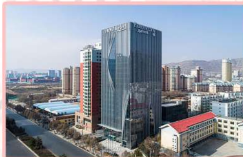
西宁万枫酒店或同级 FAIRFIELD BY MARRIOTT XINING NORTH HOTEL OR SIMILAR