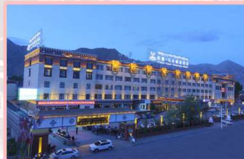
塔赫夫波德拉西藏酒店或同级 TAEHF PHODRAG TIBET HOTEL OR SIMILAR