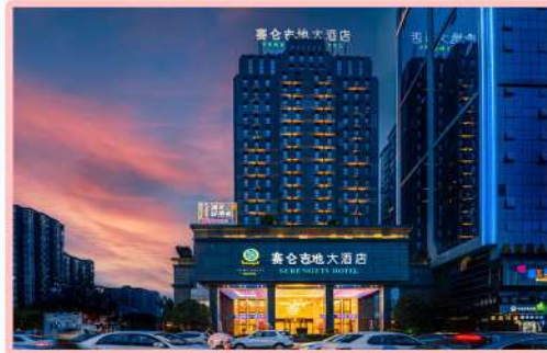
成都塞伦盖蒂大酒店或同级 CHENGDU SERENGETI HOTEL OR SIMILAR