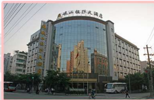
岷山大酒店或同级 MINSHAN GRAND HOTEL OR SIMILAR