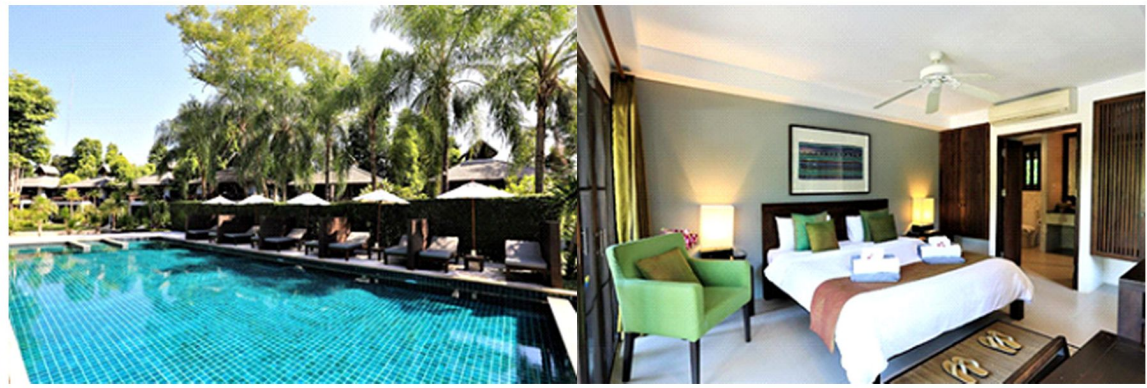
The Quarter Pai Hotel 拜县季度酒店