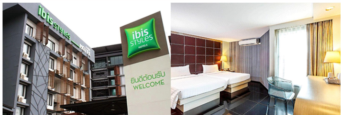
ibis Styles Hotel Chiang Mai 宜必思尚品清迈酒店