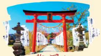
Akiu Shrine 秋保神社