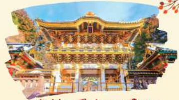
Nikko Toshogu Shrine 日光东照宫

中禅寺湖 - 丰富多彩的大自然中，还有被登入联合国教科文组织文化遗产的神社佛阁。