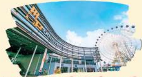
Mitsui Outlet Park Sendai Port 三弗购物中心