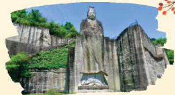
Otani Kannon-ji Temple 大谷观音寺

秋保神社 - 其以胜负之神为知名能量景点，其次是因出身仙台市的滑冰选手羽生结弦曾造访此地，也有许多羽生粉丝为了帮羽生结弦的比赛加油，而来到神社以加油之名行插旗之意祈求赢得胜利。