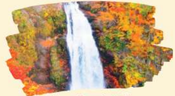
Akiu Great Falls 秋保大瀑布