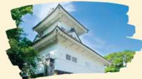
Sendai Castle Remains 仙台城迹