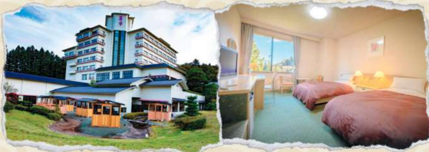
Oshu Akiu Onsen Rantei 3 stars or similar