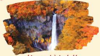
Kegon Waterfall 华严瀑布