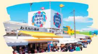
Nakaminato Seafood Market 那珂湊海鲜市场