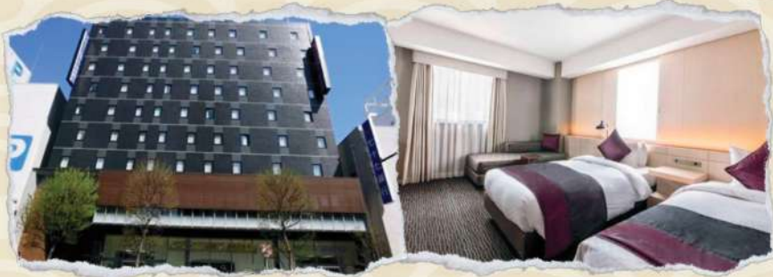
Hotel Vista Sendai 3 stars or similar