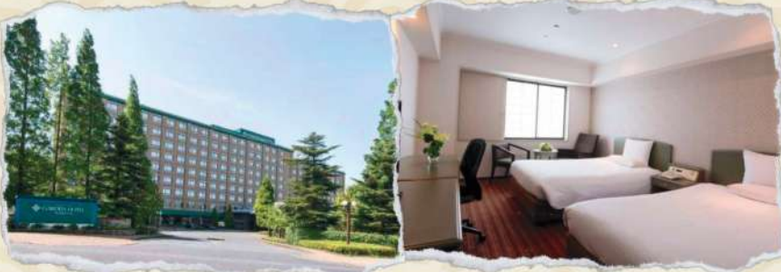
International Garden Hotel Narita 3 stars or similar