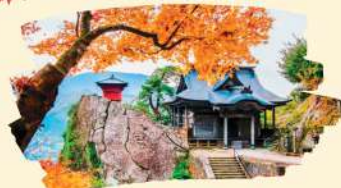
Mountain Temple 秋保大瀑布