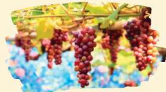
Wangjiang Fruit Picking Paradise 秋保神社