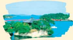
Wudai Halls 五大堂