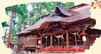
Yamagata Kumano Taisha 大谷观音寺