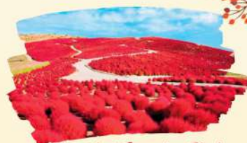
Changlu Seaside Park 长陆海滨公园

大洗神社 - 矗立于崎岖的海岸线旁，面向太平洋，常年受到海浪冲刷。此鸟居名为「神矶鸟居」，意指神明海岸上的鸟居。