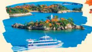
Pine Island Cruise 松岛游船

三弗购物中心 - 坐落于仙台机场与“日本三景”之一的松岛之间，是东北地区最大的购物村。