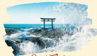
Oarai Shrine 大洗神社