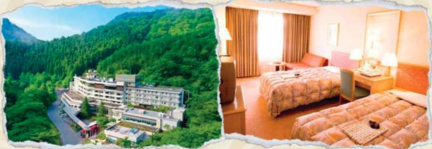
Higashiyama Grand Hotel 3 stars or similar