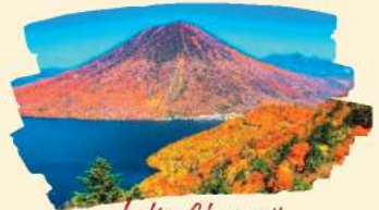
Lake Chuzenji 中禅寺湖