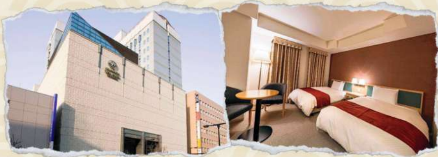
Utsunomiya Tobu Hotel 3 stars or similar