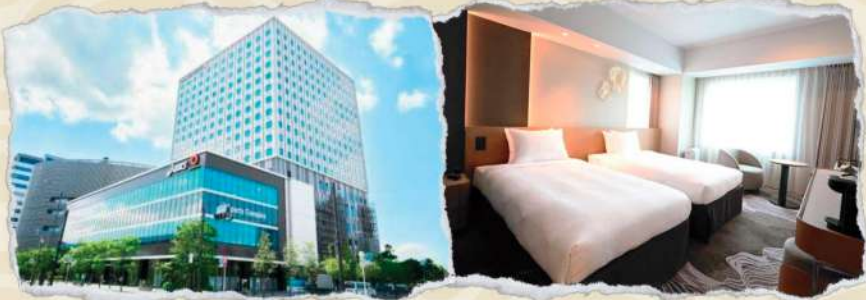
Hotel Jal City Tokyo Toyosu 4 stars or similar